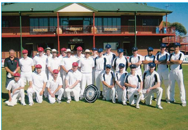
The Finalists. South Australia & Victoria