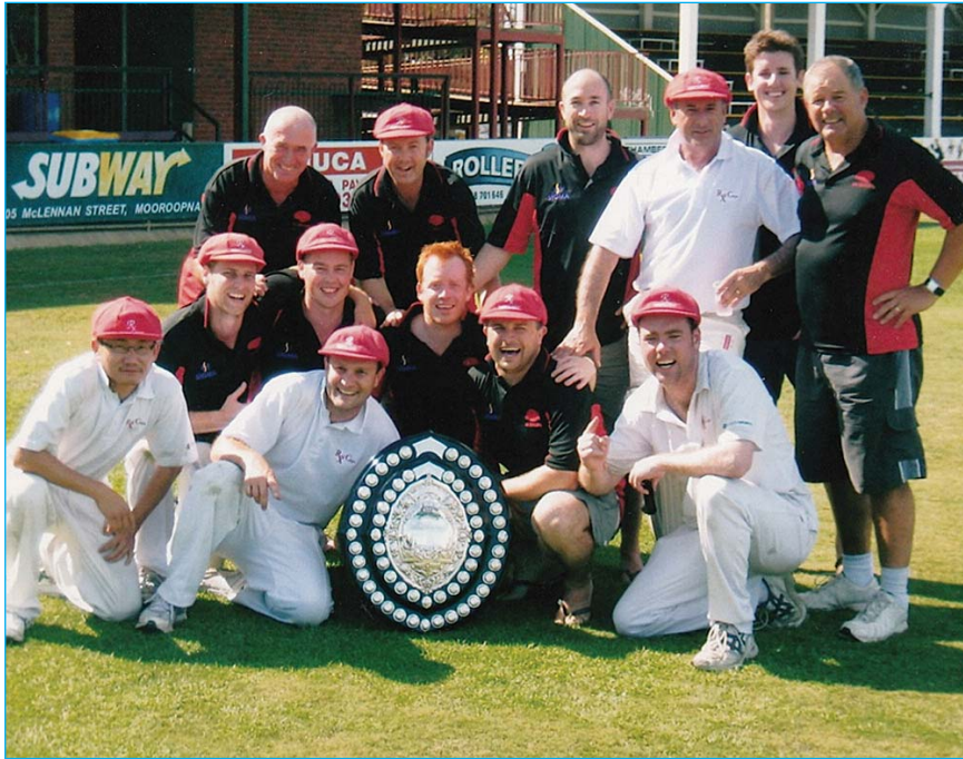
South Australia - National Champions 2010 – 2011

The ground of the Mooroopna Cricket Club, established in 1875, over the river from Shepparton, was the place from the 4th National Pharmacy Cricket Carnival.