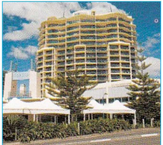
Mantra Mooloolaba Beach