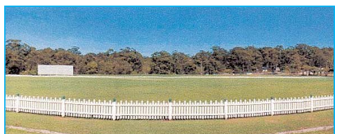
Maroochydore Cricket Club