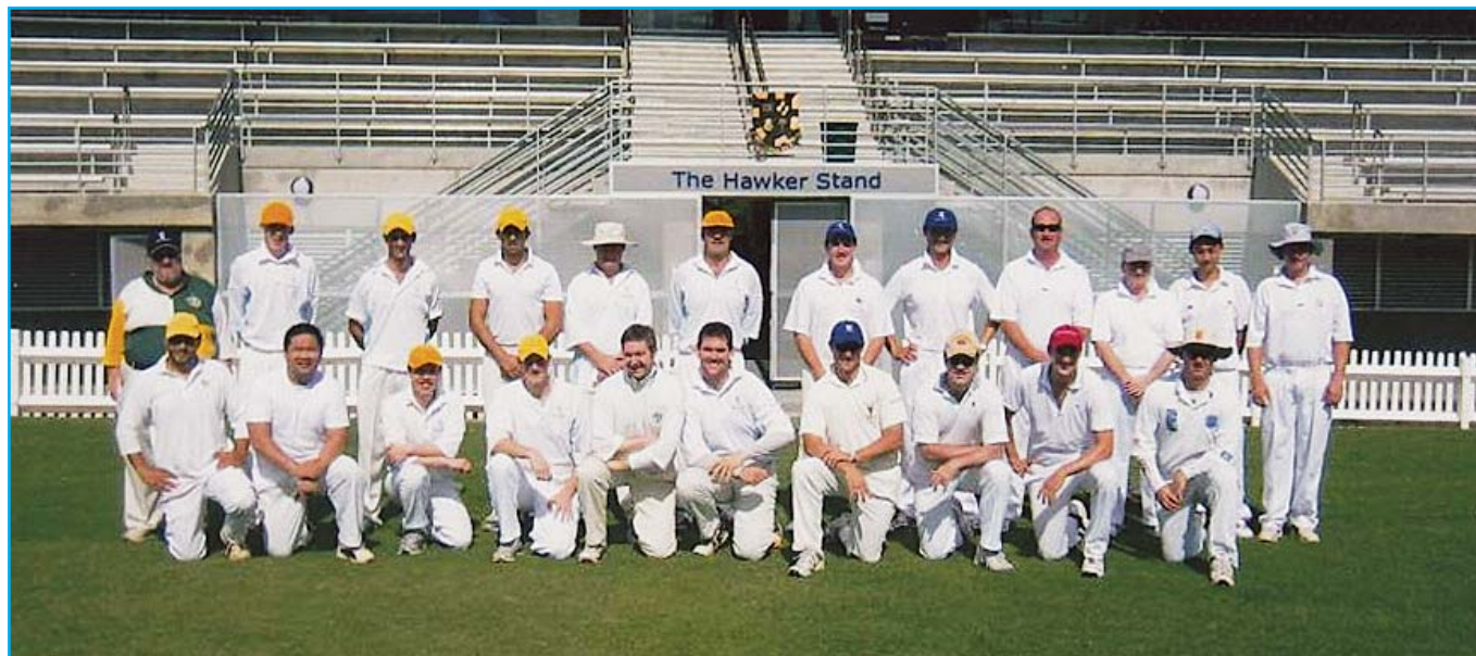
Pharmacy & Industry

On one of Sydney's best bright sunny days and at one of the best grounds in Sydney the Industry team was determined to repeat their win over pharmacy achieved last season.