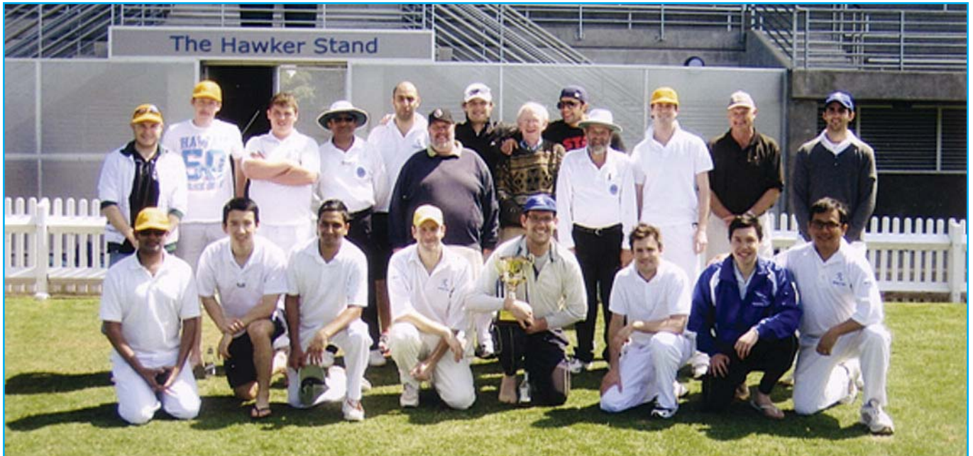
The Blues & Golds plus helpers, umpires & scorer

Shore School Northbridge – Sunday 10th October 2010