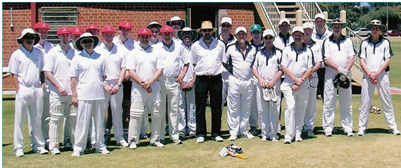
The Pharmacy & Lawyers teams

As preparation for the 2011 National Cricket Carnival in Shepparton the SA Pharmacy team set up as a trial game against the SA Lawyers (Legends) side.