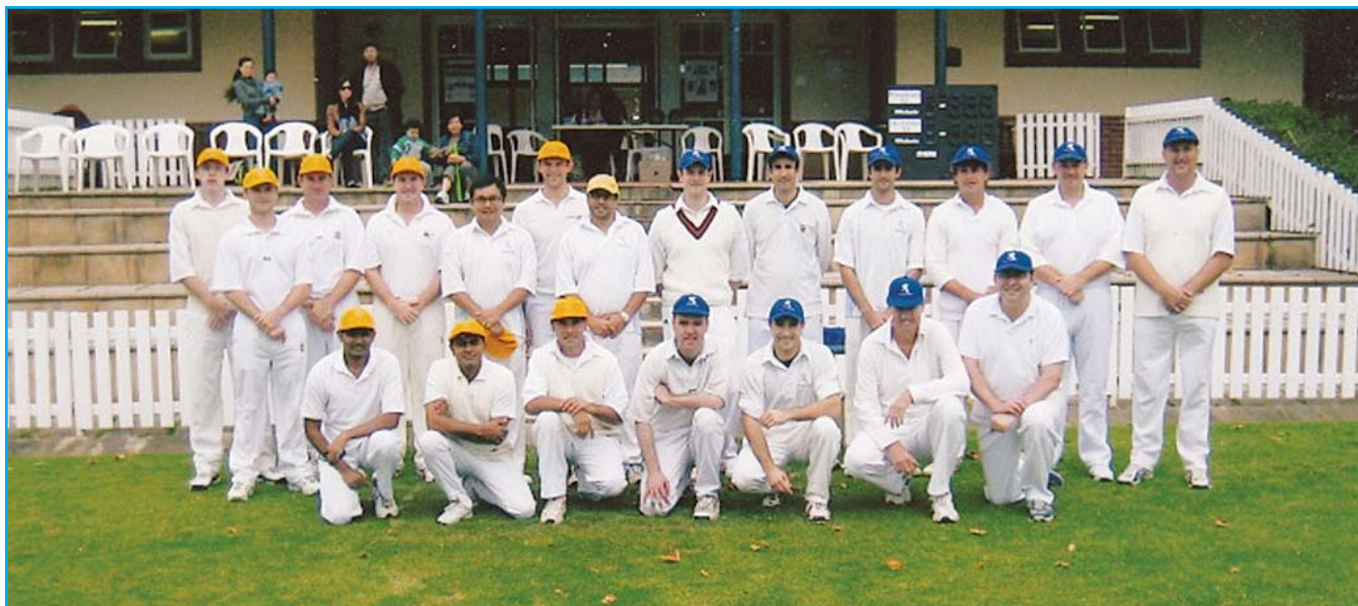
President's XI & Invitation XI